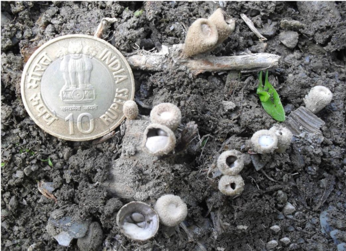
Fig. 1 – Fruiting bodies of Cyathus olla in natural habitat.

Epiphragm thick, pale whitish and persistent. Margins circular and entire when young but wavy at maturity; eggs or peridioles about 2 – 3 mm in diameter and attached to base of peridium by a funicular cord. Peridioles 11 in number, oval or egg-shaped pure silver to blackish. The assemblage of peridioles resembled eggs lying in the bird's nest (Fig.1).