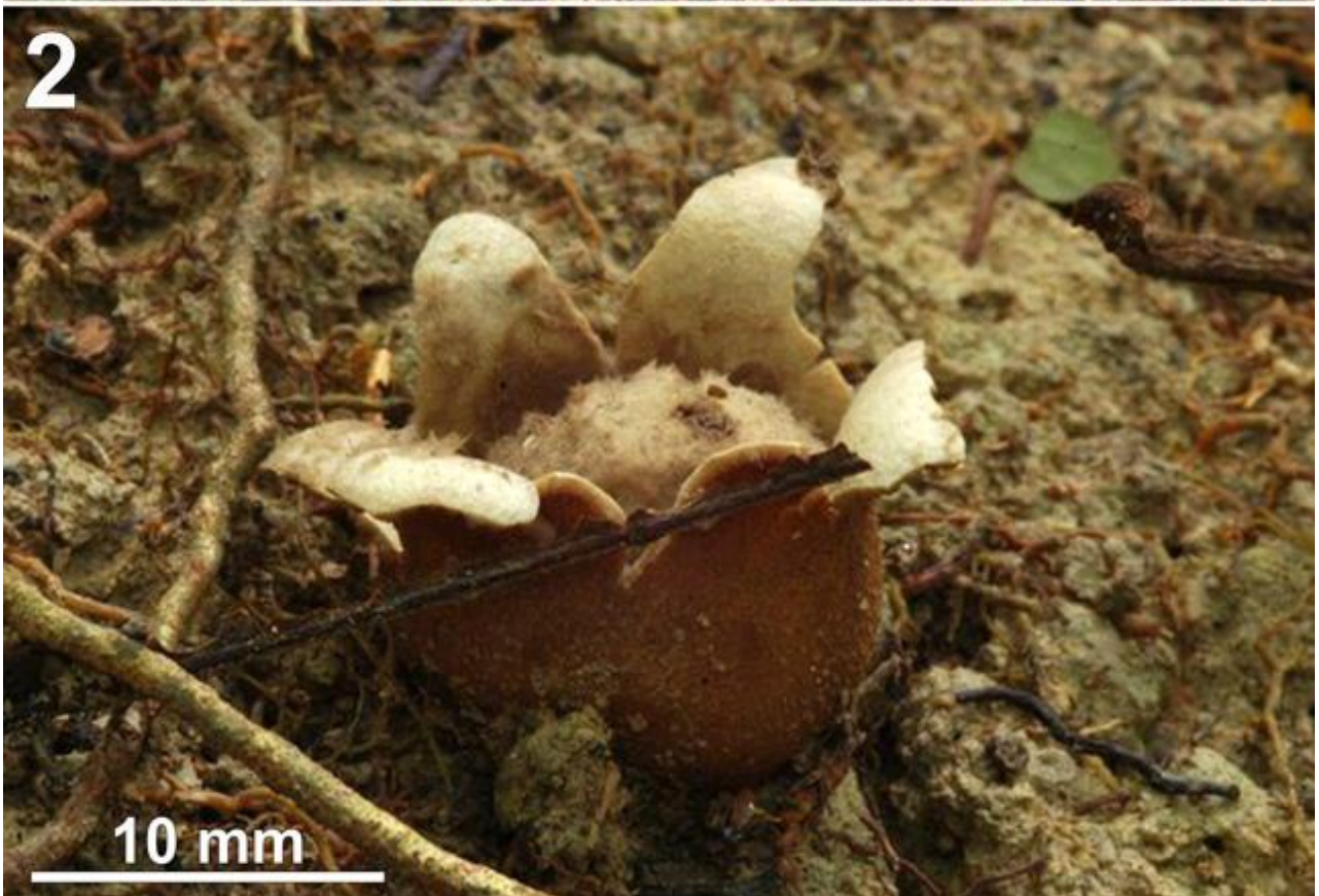
Figs 1–2 – Scleroderma minutisporum . 1 Amazon forest, Ducke Forest Reserve (type locality). 2 Mature basidioma (holotype).