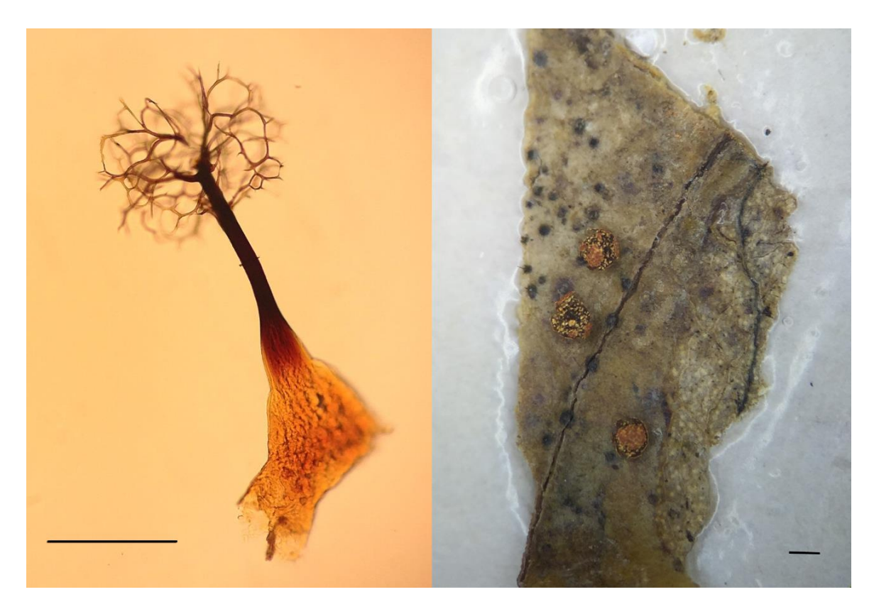
Fig. 2 – Images of two species not previously recorded in Costa Rica. Left. Paradiacheopsis solitaria (USJ 104006) from Las Tablas, scale is 100 \mu m. Right. Physarum lateritium (BioRep 6722) from Bonilla, scale is 1 mm. For details see the Materials and Methods section.

From Las Tablas Protected Zone, 8.923780 N and 82.722837 W at 1550 m. Recorded in a moist chamber culture prepared with leaf litter from the lower section of a ground litter layer 6 cm deep. In a tropical lower montane wet forest dominated by Quercus spp. on the Pacific slope. Material collected on 10 January 2014. pH = 4.31. Collection Ro-4920 (USJ 104006). New record for Central America.