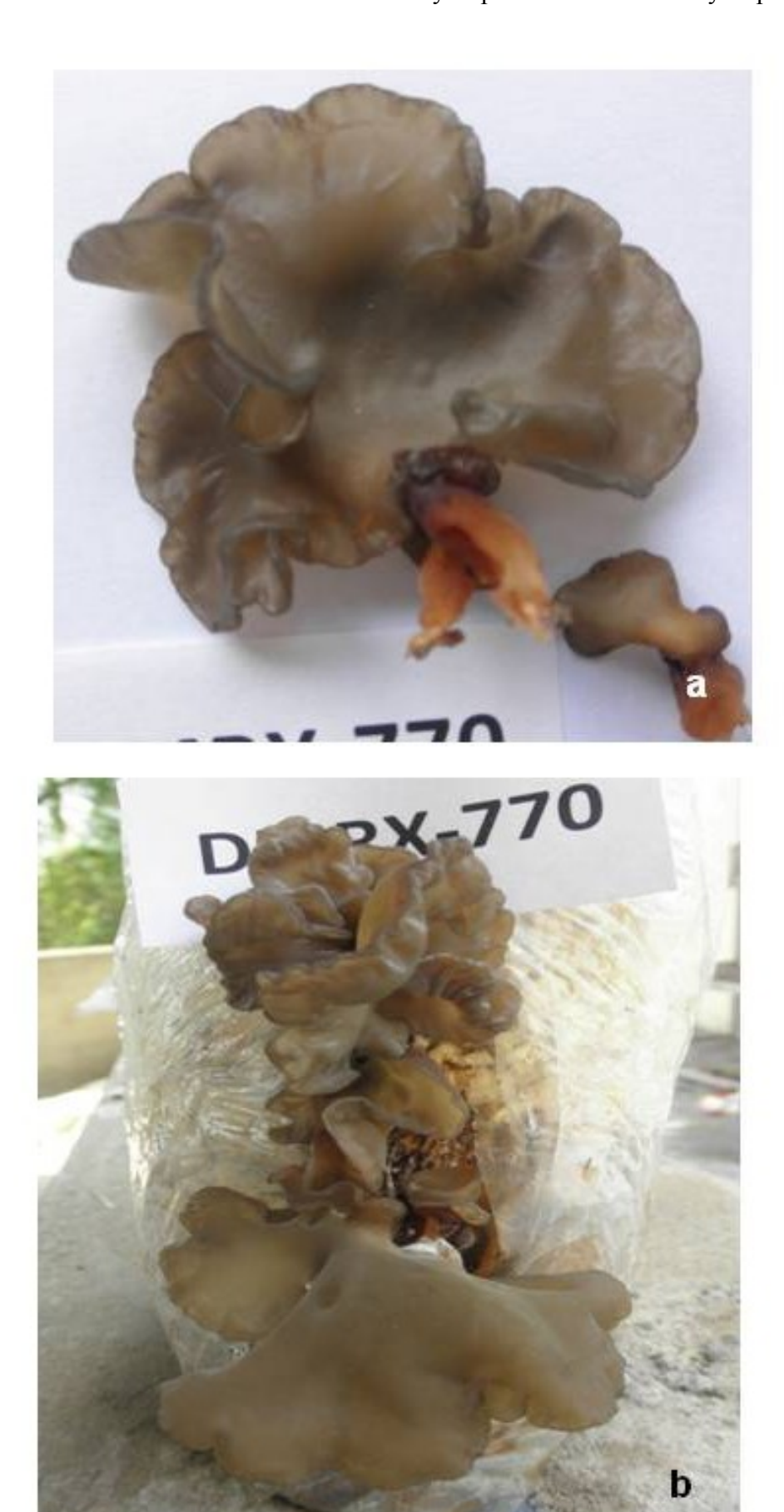
\textbf{Fig. 1} - Auricularia\ olivaceus\ \text{sp.\ nov}.